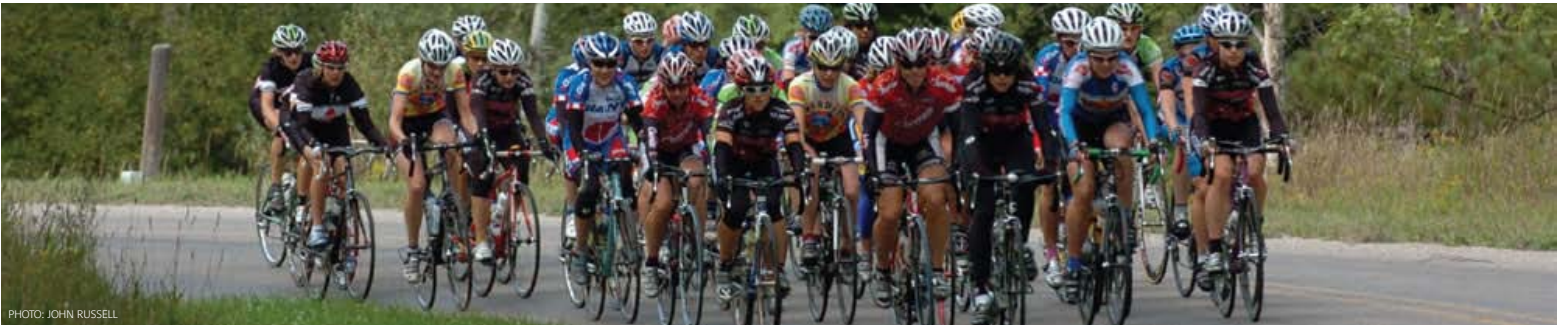
The women enjoy a moment of relaxation on the back side of Glen Arbor